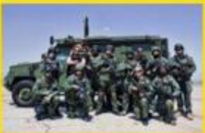
Training Merced County, California SWAT team in counter terrorism