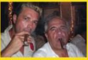
With the President of Colombia, Ernesto Samper, a decade ago